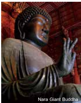
Nara Giant Buddha

The Grand Tour of Japan offers something for every visitor of Japan, whether you wish to see the Giant Buddha in Nara, climb up to the fifth station of Mt. Fuji, sip a cup of tea at a traditional Green Tea Ceremony or ride a Bullet Train, you will be surprised by how many of these we have managed to fit into one tour, Grand Tour of Japan. It is full of truly unforgettable experiences you will remember for a long time.