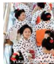
Yukata Girls, Kyoto

■ Air Fare: Please check our website for current air fare from your departure city.