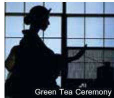
Green Tea Ceremony

Whether you want to taste the Okonomiyaki in Hiroshima, encounter the Giant Buddha of Nara, soak in the hot springs in Dogo Onsen, sample the traditional Japanese dinner in kimono robe, or see the ancient temples in Kyoto, the Grand Tour of Japan offers the perfect itinerary for anyone who wishes to see Japan in depth.