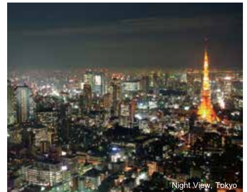
Night View, Tokyo

Grand Tour of Japan provides an unforgettable diverse tour at an affordable price, the perfect journey for anyone who wishes to see the best of Japan.