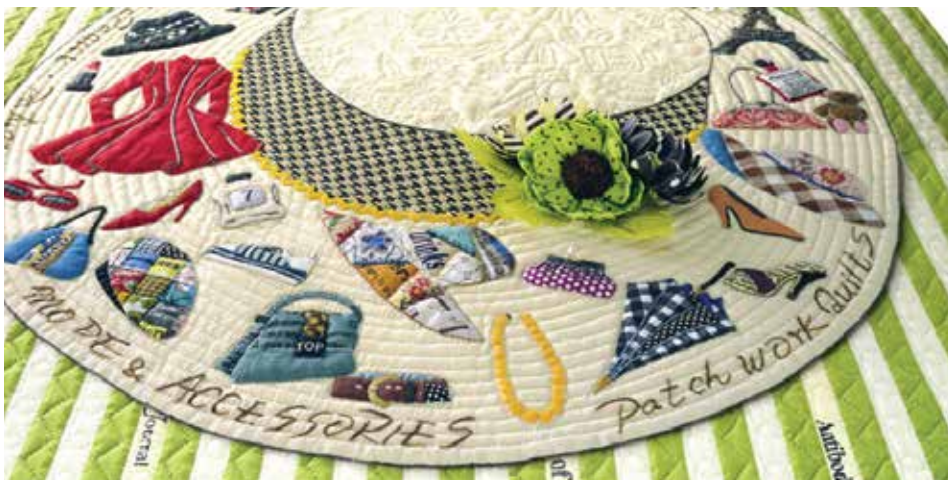
QUILT CREATED BY: SUZUKO KOSEKI